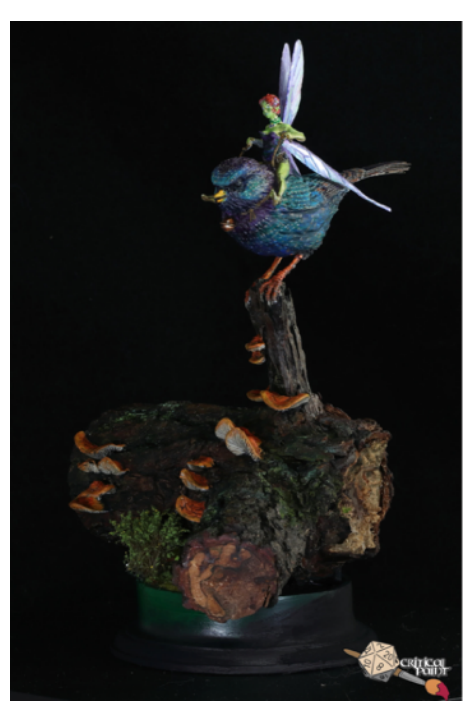
"Scout, Model 'Tinker Bell' from Blacksmith Miniatures base is a mixture of natural and handcrafted 3D assets, one of my favourites I think this piece would be nowhere near as good as it is without the base"

Picture this: even the most visually unremarkable miniature can ascend to the echelons of miniature painting excellence with a remarkable base. If the miniature itself is the story, think of the base as the environment and supporting characters-crucial elements that enrich the narrative. Here's a crucial aspect to remember: the base shouldn't divert attention away from the miniature; instead, it should draw the viewer's focus towards it. Achieve this effect through clever use of light and shadow, employing complementary or contrasting colours, incorporating movement, and strategic placement within the scene. Even a minimalist base, when thoughtfully designed, can effectively highlight the miniature. You don't have to go extravagant; it's about crafting a base that complements and enhances the story your miniature is telling.